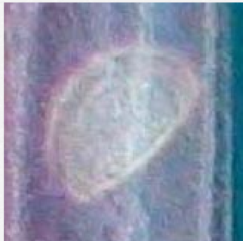
The Half circular type