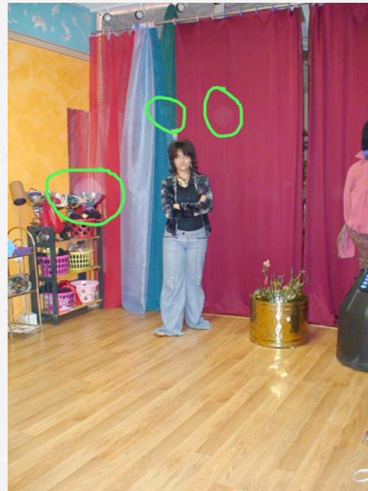
Sony HD with Flash Lots of "Orbs"