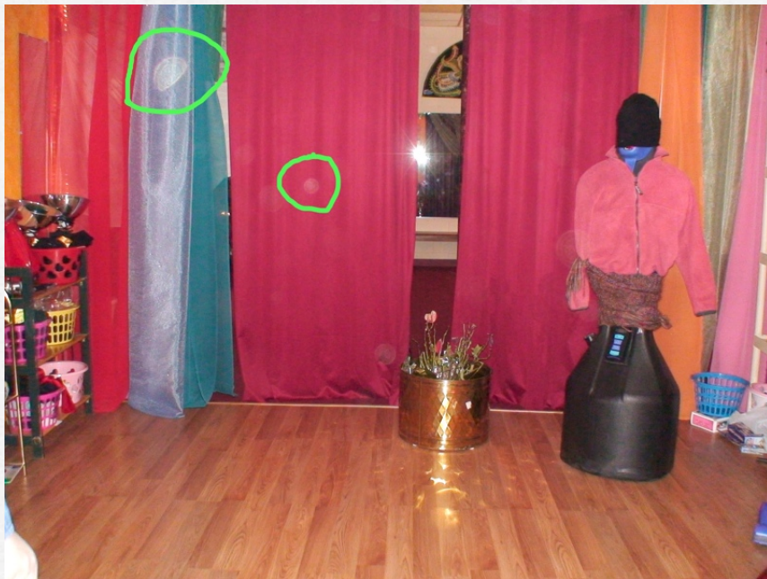
Sony HD camera with flash Several "Orbs" present

These two images were taken at the same time 1-with the Sony HD camera 1-with the Nikon D-70 and a flash bracket