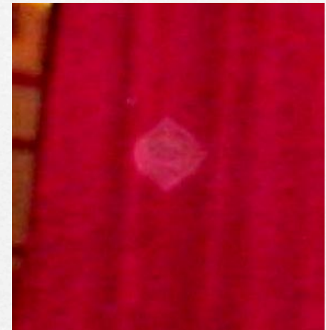
The Diamond type

We had to determine why 2 of the same type of cameras would produce different size, shape & textured "orbs"