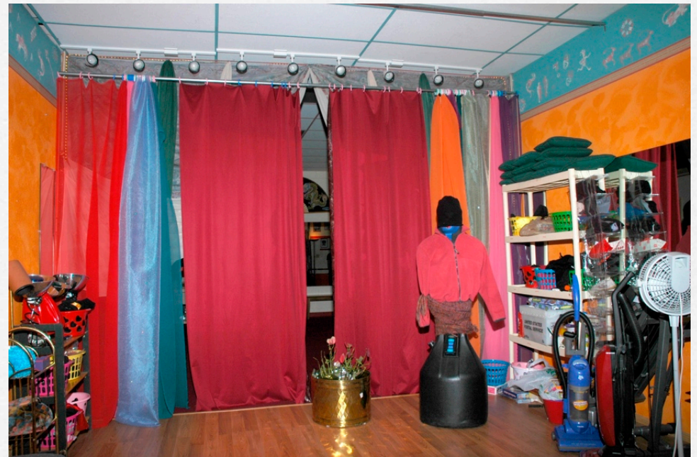
Nikon D-70 with flash & flash bracket No "Orbs"