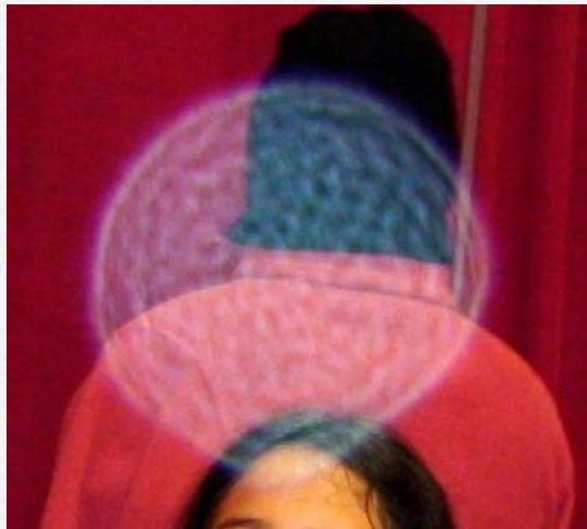
The Circular type

The "Orbs" that were being recorded are of different shapes and sizes