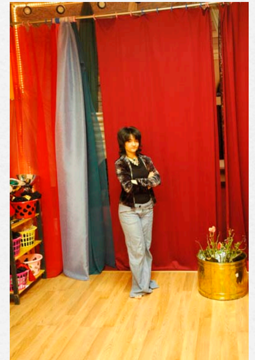
Nikon D-70 with Flash but no "Orbs"