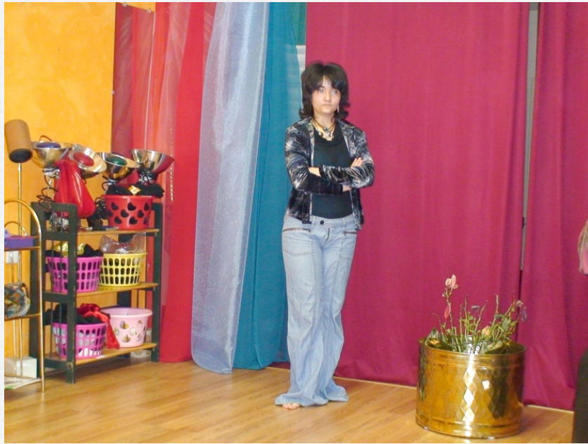
Sony HD with flash but no "Orbs"

The Nikon Had the flash mounted on a bracket that places it several inches from the lens