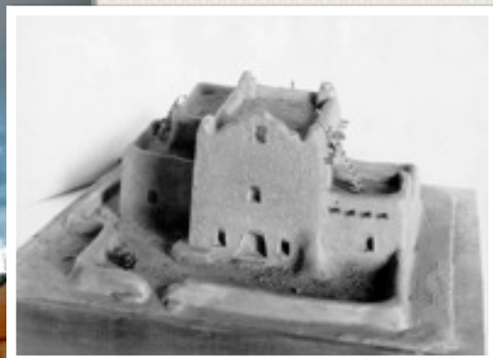
THE EXTERIOR OF THE TRADING POST AND A MODEL OF THE BUILDING