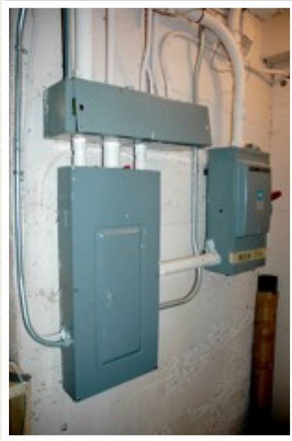
The main electrical panel

Sacred Stones Colorado's Red Rocks Park & Amphitheater. By Thomas Noel