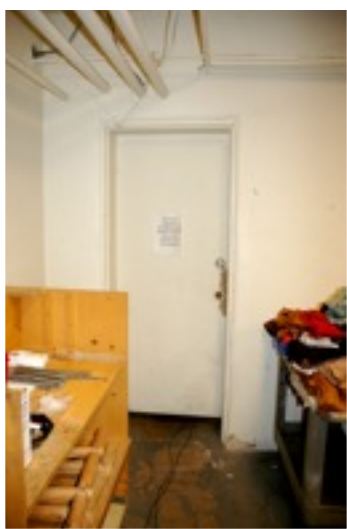
The door with broken handle

No unusual sound were monitored during the investigation.