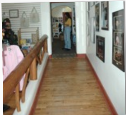
RAMP WHERE FOOTSTEPS WERE HEARD

We started the investigation by researching the history of the property and collecting the current reports of paranormal activity